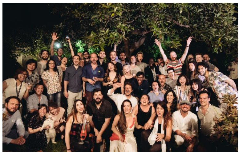
Les Nuits En Or - Directors Tour 2019, Apulien Italy 35 international filmmakers together on Europe tour.