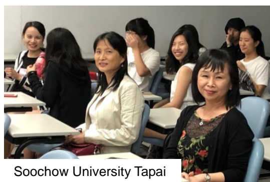
Soochow University Taipei